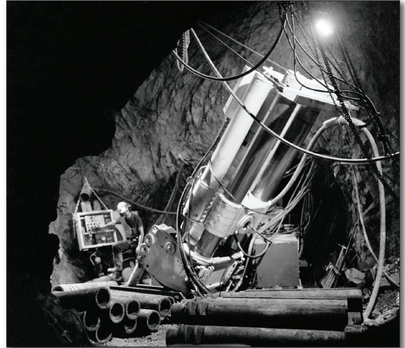
A raise bore machine in operation in the mine. This is a rare underground photograph as it was taken using only available light.