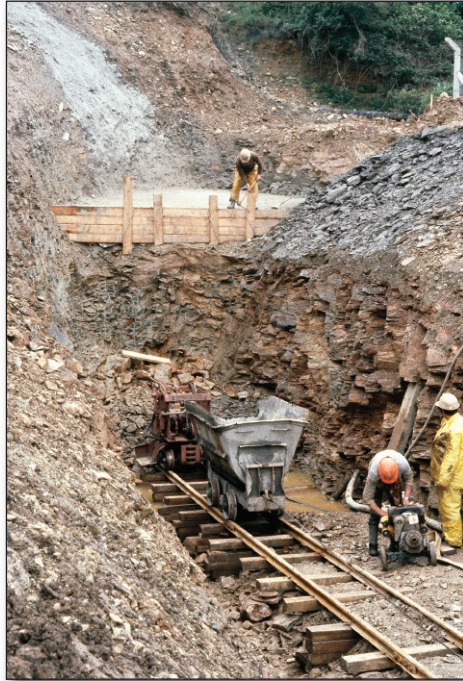
The ground is being prepared for the new portals of the County Adit.